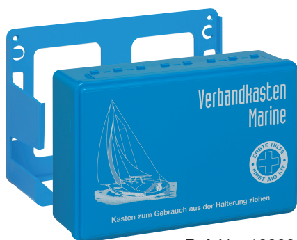
Ref. No. 12900