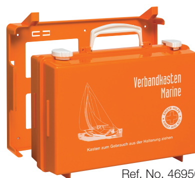
Ref. No. 46950

HANS HEPP Dressings and first-aid material