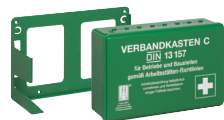
Ref. No. 45120 Ref. No. 45100

Our product portfolio is rounded off by additional materials for manual workers, the first-aid box "Eyes", stretchers and fire blankets.