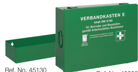
Ref. No. 45130 Ref. No. 45200