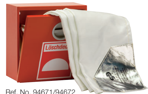
Ref. No. 94671/94672