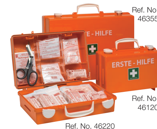
Ref. No. 46220