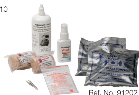
Ref. No. 91202