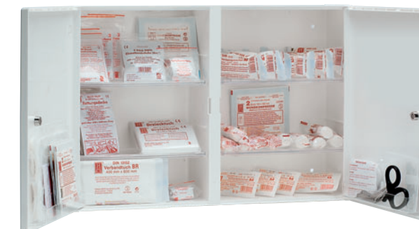
Ref. No. 45560