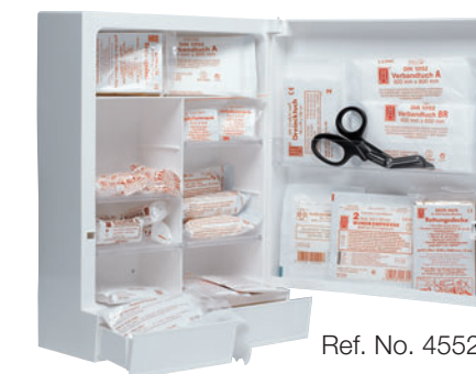
Ref. No. 45520