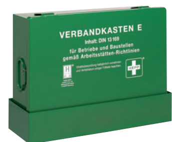
Ref. No. 45210