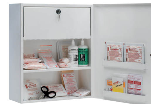
Ref. No. 45610