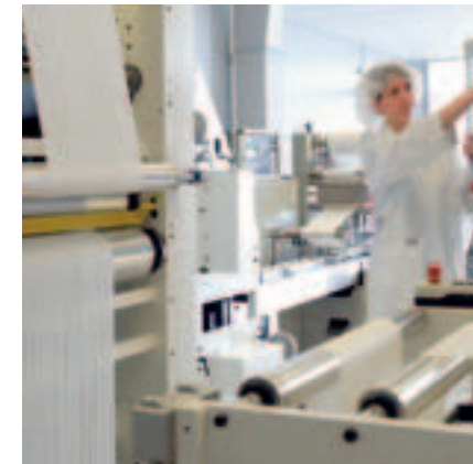
Clean room – Production of dressings

Responding to customer wishes, as well as many years of experience and HEPP's contacts in trade and industry guarantee for a positive future.