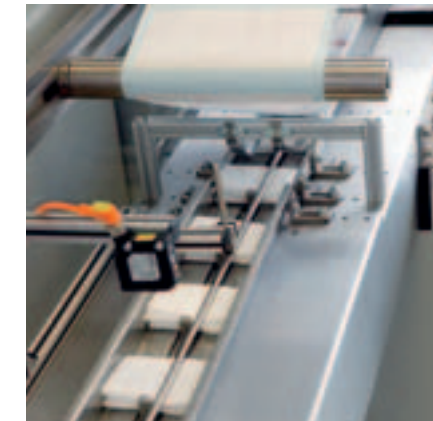
Clean room – Fleece processing