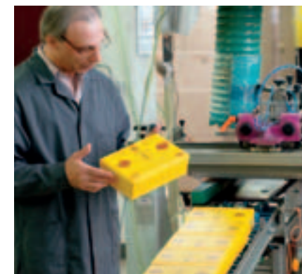
Screen printing – Control of printed design