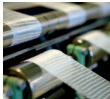
Weaving department – Automatic loom in operation