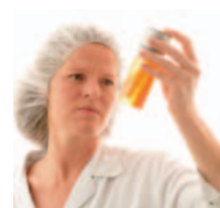
Laboratory – Product analysis /Quality control

allow an individual, multi-coloured print design. Due to the wide vertical range of manufacture, HEPP is able to supply its customers at short notice and flexibly, even with small orders.