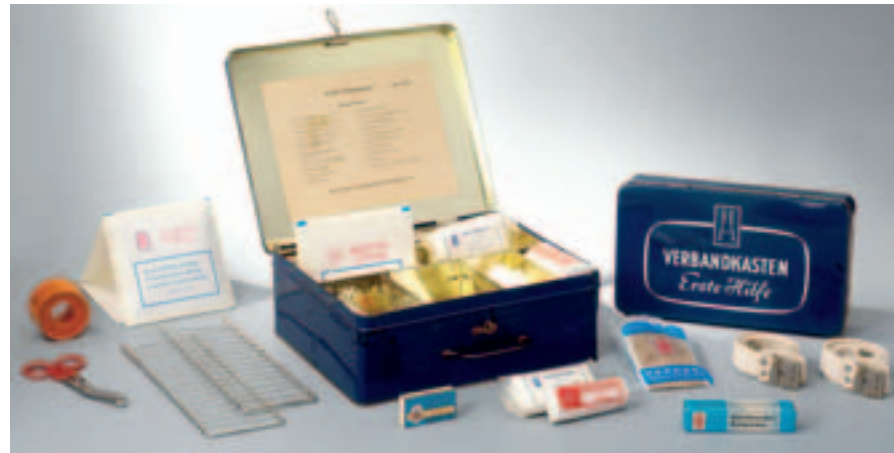
First-aid boxes and dressings from the HEPP archives