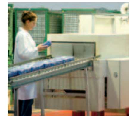
Production – Shrink-wrapping of first-aid bags