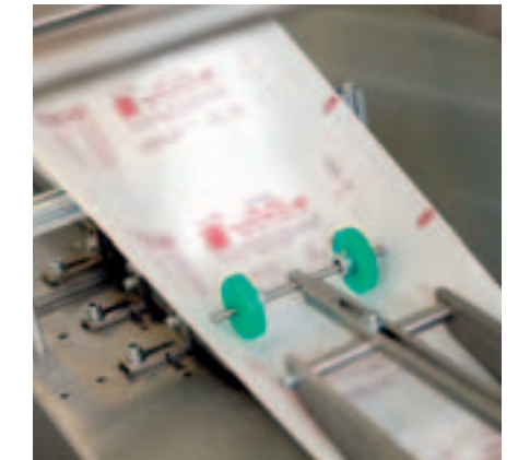
Clean room – Automatic paper wrapping