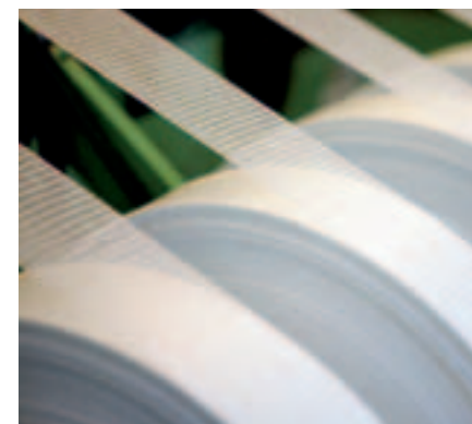
Weaving dept. – Rolling up of material for bandages