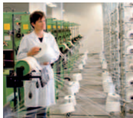
Weaving department – View of the automatic loom

HEPP has for many years worked together successfully, not only with customers, but also with its suppliers. Through a targeted selection of suppliers and its own quality laboratory, HEPP guarantees a constant, unchanging quality of products, which corresponds to the European Law for Medical Products. At HEPP the quality control does not only take place at the end of the quality production process, but rather already at the beginning of the production process, through an extensive inspection of incoming materials. Since its first certification in 1995, HEPP has continually adapted its Quality Management System to the requirements of the developing market and the European Law for Medical Products and has passed the annually required audits.