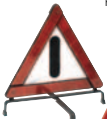
GERMAN Ref. No. 91700

Our orange-red or fluorescent yellow high visibility waistcoats comply with the general requirements of DIN EN 471 and are made from PVC-coated, water-resistant fabric or from polyester fabric. The waistcoats are available in a washable orange solid PVC protective bag (recommended for frequent use) or in a transparent pouch.