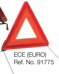
ECE (EURO) Ref. No. 91775