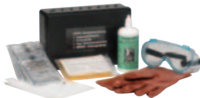
Ref. No. 91090

Unforeseen breakdowns such as a flat battery, a broken fan belt or a defective generator could mean that your vehicle is temporarily abandoned. Using a tow rope, your broken-down vehicle can be towed to a garage for repair. In order to ensure that towing can be carried out safely with a high towing force, the rope must be designed to carry at least 4 tonnes and be of good quality.