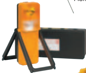
Ref. No. 91995

The warning triangles supplied by us comply with the general requirements of an accredited European testing establishment and are available in various designs and sizes (German and European versions).