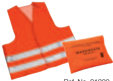
Ref. No. 91900