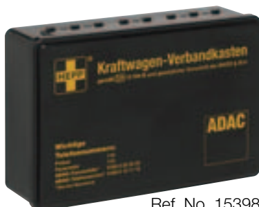
Ref. No. 15398

In Germany, the Straßenverkehrs-Zulassungs-Ordnung (StVZO) (the regulations governing the use of vehicles on the road) requires that vehicles carry first-aid materials in compliance with DIN 13 164. Our knowledge and striving to provide the highest quality of protection for the user is reflected in our comprehensive range of first-aid boxes for cars shown below.