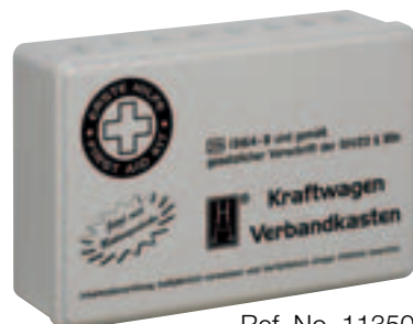
Ref. No. 11350