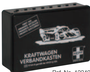
Ref. No. 12240