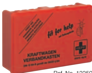
Ref. No. 12250